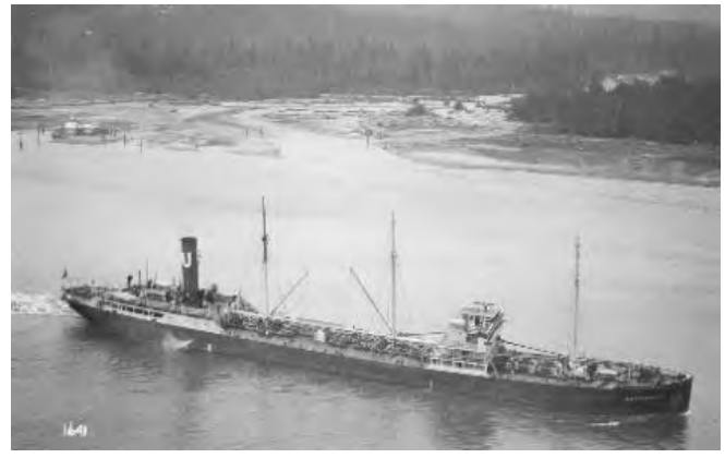
Montebello underway

Did you know that within the boundaries of the proposed sanctuary lie the remains of the oil tanker Montebello? The 1921 tanker, carrying over three million gallons of crude oil, was sunk by a single torpedo fired by a Japanese submarine during World War II in December 1941, just two weeks after the attack on Pearl Harbor. The Montebello sits in 900 feet of water approximately seven miles southwest of Cambria. ONMS has led or participated in two missions to the shipwreck,