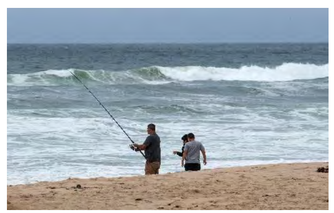
A Family Fishing from Shore

Do you have any amazing photos from your visits to national marine sanctuaries? <u>Learn more about</u> the photo contest and submit your photos for consideration by Sept. 5. Winning photos will be announced in October.