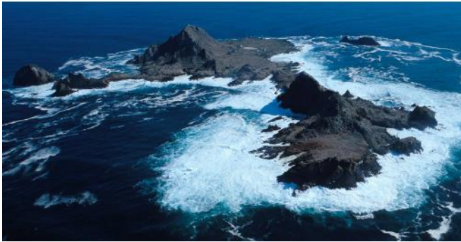
Greater Farallones National Marine Sanctuary is a globally significant, extraordinarily diverse, and productive marine ecosystem that supports abundant wildlife and valuable fisheries.

that have been occurring over the northeast Pacific since 2013. A ridge of higher-than-normal sea level pressure set up during the winter of 2013-2014 over the northeast Pacific. That strong ridge of higher-than-normal pressure blocked the usual parade of storms across the Pacific. That meant less heat than usual was drawn out of the ocean into the atmosphere. This meant there was less cold water (from the deeper ocean) mixing near the surface of the ocean. These changes in ocean patterns have impacted ecosystems, like those in Greater Farallones National Marine Sanctuary.