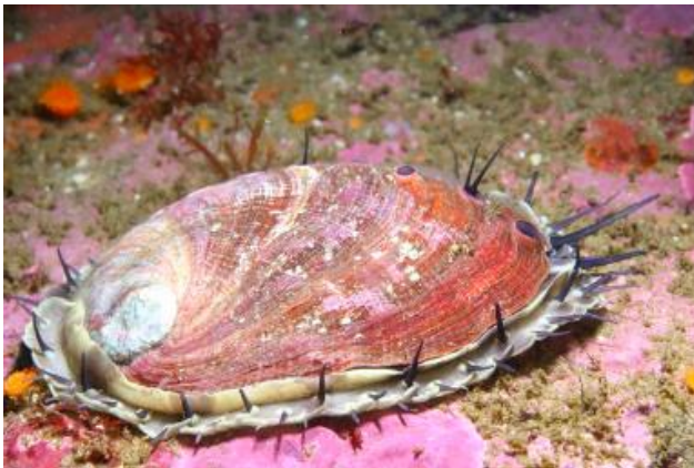
Pictured here is a young and healthy red abalone.