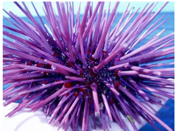
Sea urchins, like this purple urchin, graze kelp and may reach population densities large enough to destroy kelp forests.

The severe reduction in kelp has already impacted humans through the collapse of the red sea urchin fishery in the region and the complete closure of the recreational red abalone fishery. Both fisheries are economically important in northern California. Abalone and sea urchins are both herbivores and depend on healthy kelp ecosystems for both food and shelter. Due to the recent loss of kelp, many abalone and red urchins are starving, which is causing them to exhibit some very unusual behaviors. Scientists in California have documented abalone climbing stalks in search of kelp blades and small abalone leaving rocky crevices they hide in for safety in search of food.