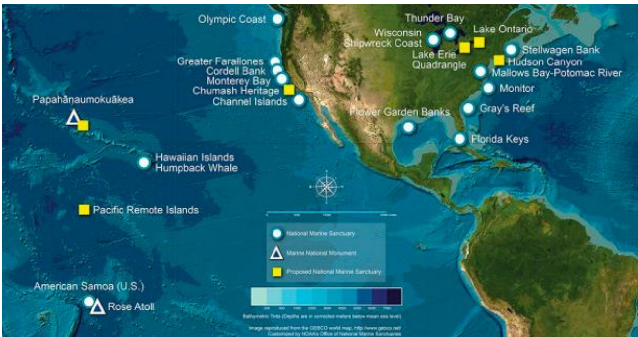
A map of the National Marine Sanctuary System in the U.S. and its territories.