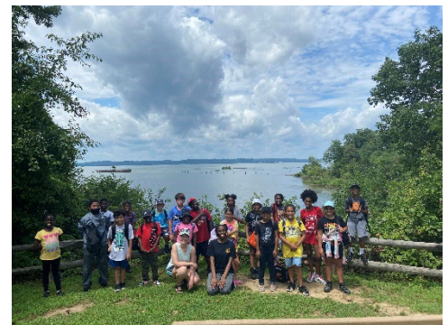
Students learn about water quality at Malloys Bay Park.