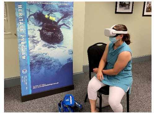
Attendee of a community event takes a virtual tour of Malloys Bay.

An immersive video of Malloys Bay-Potomac River National Marine Sanctuary was launched as part of the Sanctuaries 360° series of virtual reality experiences. Using an Oculus VR headset, participants can tour Malloys Bay virtually through a four-minute video that highlights the history of the Ghost Fleet, explores wildlife and habitat at the site, and replicates the feeling of kayaking through the sanctuary. Sanctuary staff have used this tool for outreach and engagement at numerous community events, making Malloys Bay accessible to all.