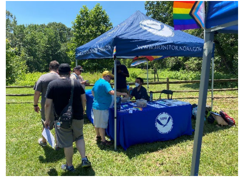
Attendees of Pride Day at the Bay learn about our sanctuaries.

The sanctuary hosted three public events for Get Into Your Sanctuary: Juneteenth, a celebration and reflection of the national holiday; Pride Day at the Bay, a celebration of Pride Month; and Blue Star Families Welcome Week, an event to welcome active military families who recently relocated to the region. With the help of numerous partner organizations, participants of each event had the opportunity to kayak, join a guided hike, take a virtual tour with the Oculus VR headsets, and more. Between all three events, hundreds of visitors had the chance to experience the sanctuary and many new connections were made within the community.