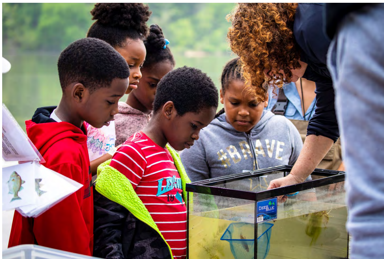
Communicating about climate impacts, resiliency, and other conservation topics through sanctuaries like Mallow's Bay-Potomac River National Marine Sanctuary is a critical component of building climate-resilient sanctuaries.