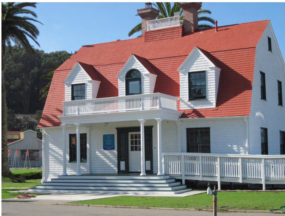
The Ocean Climate Center and Greater Farallones National Marine Sanctuary, and other facilities across the National Marine Sanctuary System, are working to assess and reduce their greenhouse gas emissions.