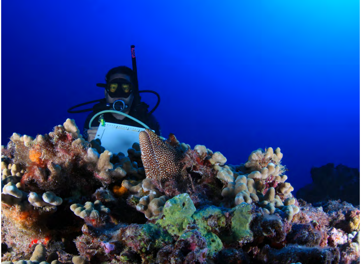
A scientific diver collects data on a reef in Papahānaumokuākea Marine National Monument. Research conducted in sanctuaries is critical to understanding climate change and its impacts.