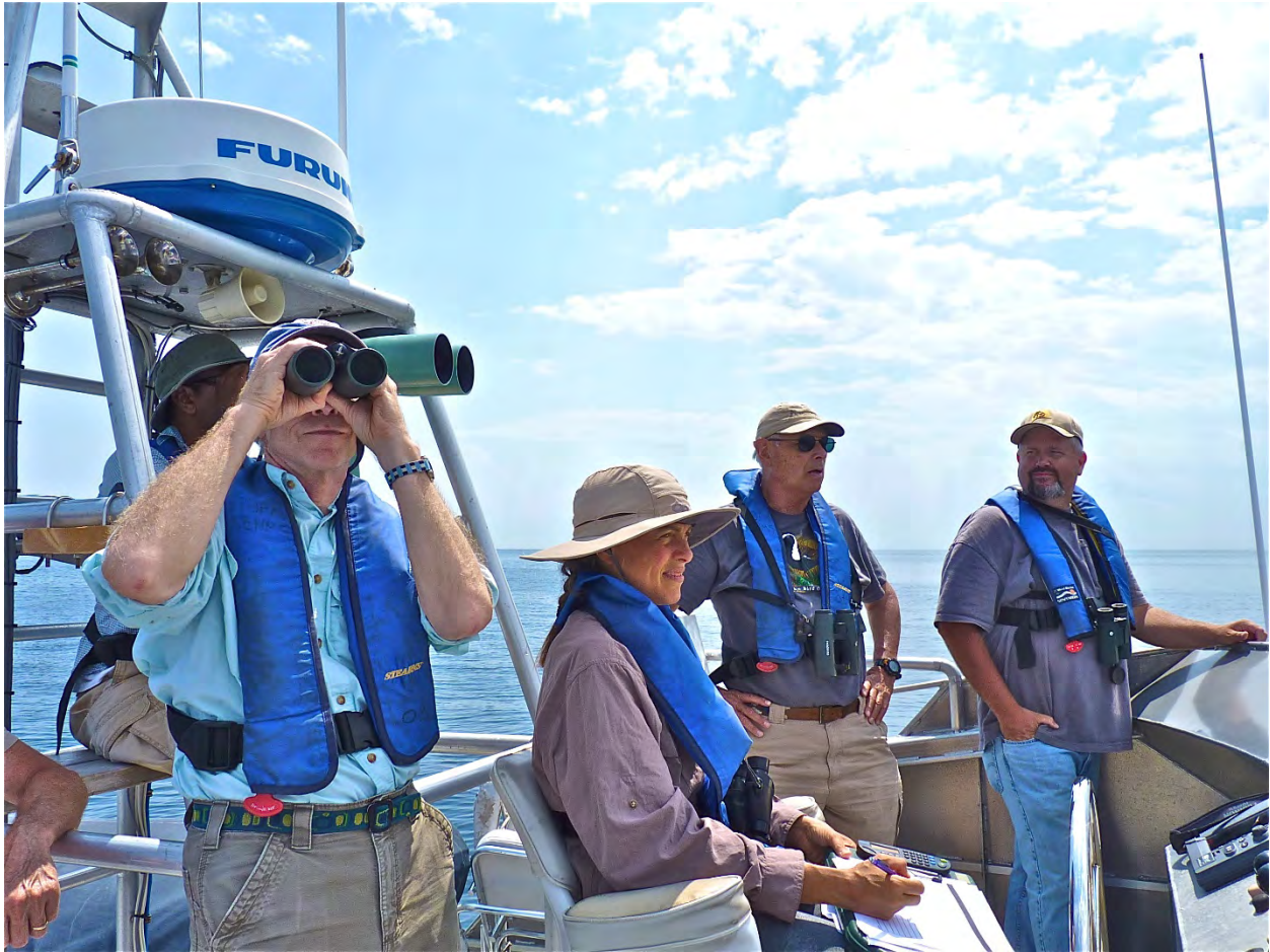
Planning, observing, and monitoring at sanctuaries, like Stellwagen Bank National Marine Sanctuary, is key to successful climate adaptation, management, and resilience.