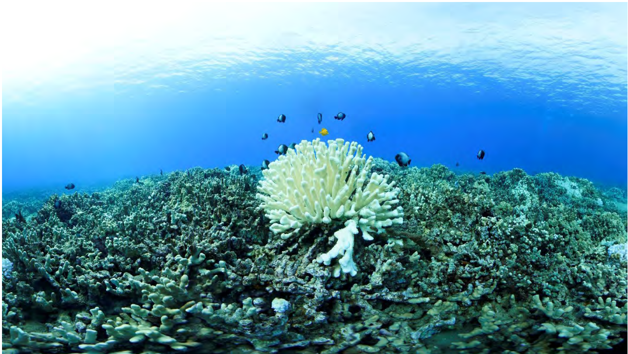
Coral bleaching, as seen in this coral found in Hawaiian Islands Humpback Whale National Marine Sanctuary, is often caused by waters that are too warm and is one of the many impacts of climate change being experienced by sanctuary resources.

This climate resilience plan outlines near-term steps that NOAA's Office of National Marine Sanctuaries (ONMS) will take to address climate impacts in order to achieve our mission. It is intended to be aligned with the existing (2018-2022) and new ONMS Strategic Plans (2023-2027), and is based on discussions with the Sanctuaries Leadership Team as well as staff input for the new Strategic Plan. This plan is intended to be updated in FY23 to reflect progress towards the goals identified below. It will be accompanied by implementation guidance in support of the four goals: science and assessment; adaptation and mitigation; education and outreach; and green operations.