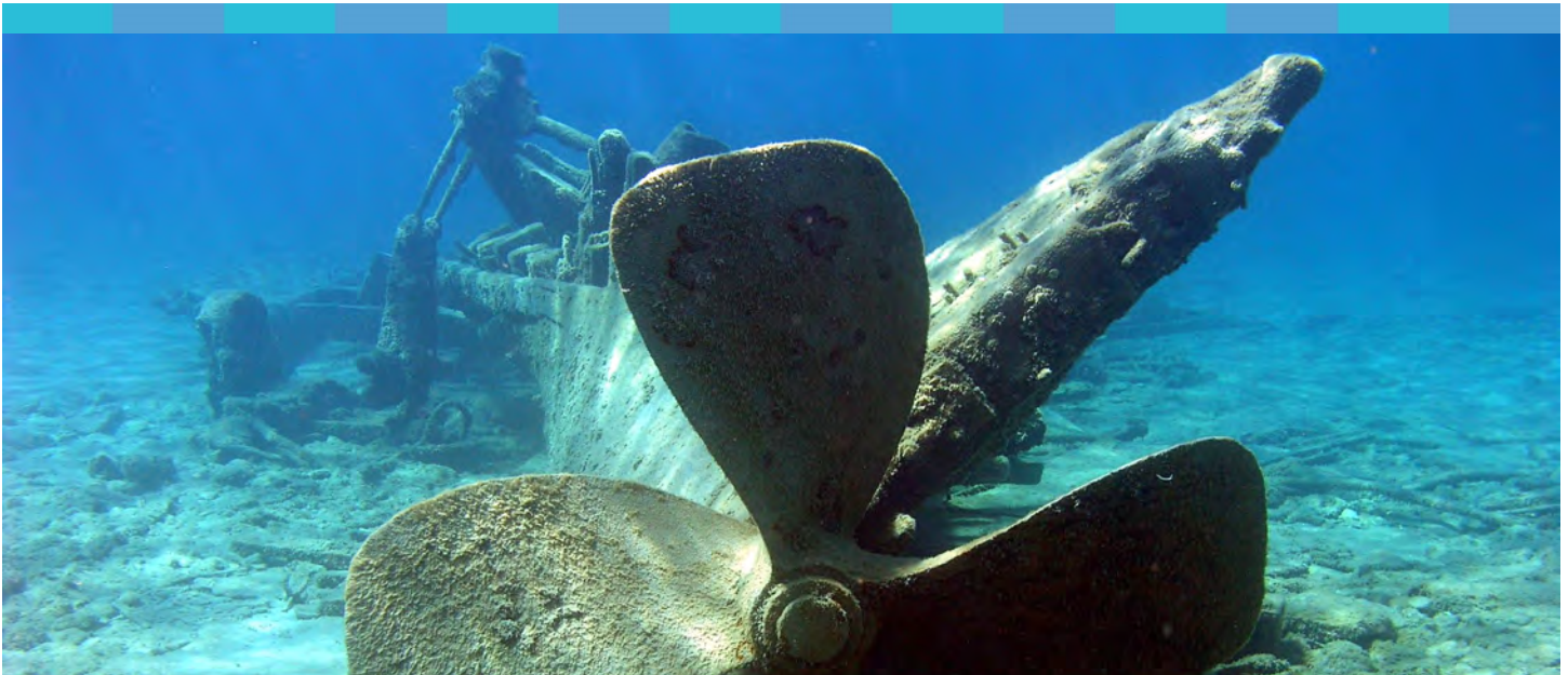
Thunder Bay National Marine Sanctuary protects over 100 of the country's most well-preserved and nationally significant shipwrecks.