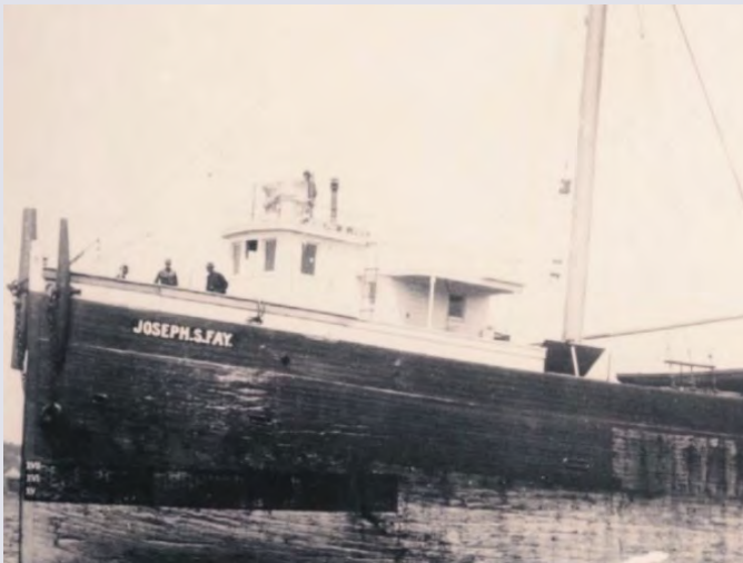
The Joseph S. Fay was lost to a strong gale on October 19, 1905.

On the night of October 19, 1905, the 216-foot bulk freighter Joseph S. Fay wrecked when it ran aground at Forty Mile Point during a strong gale. The lower hull of the Fay rests just off shore in 17 feet of water. Some of its iron ore cargo is still present, as are the ship's rudder, copper hull sheathing, portside engine mount, and other machinery. In addition, a 134-foot portion of the Fay's starboard side rests on the beach not far from the lighthouse. Both the submerged and beached sections of the shipwreck are popular recreational sites. The beached section is also used as a training site for students interested in archaeology. More than a century after it wrecked, the Fay is again in danger.