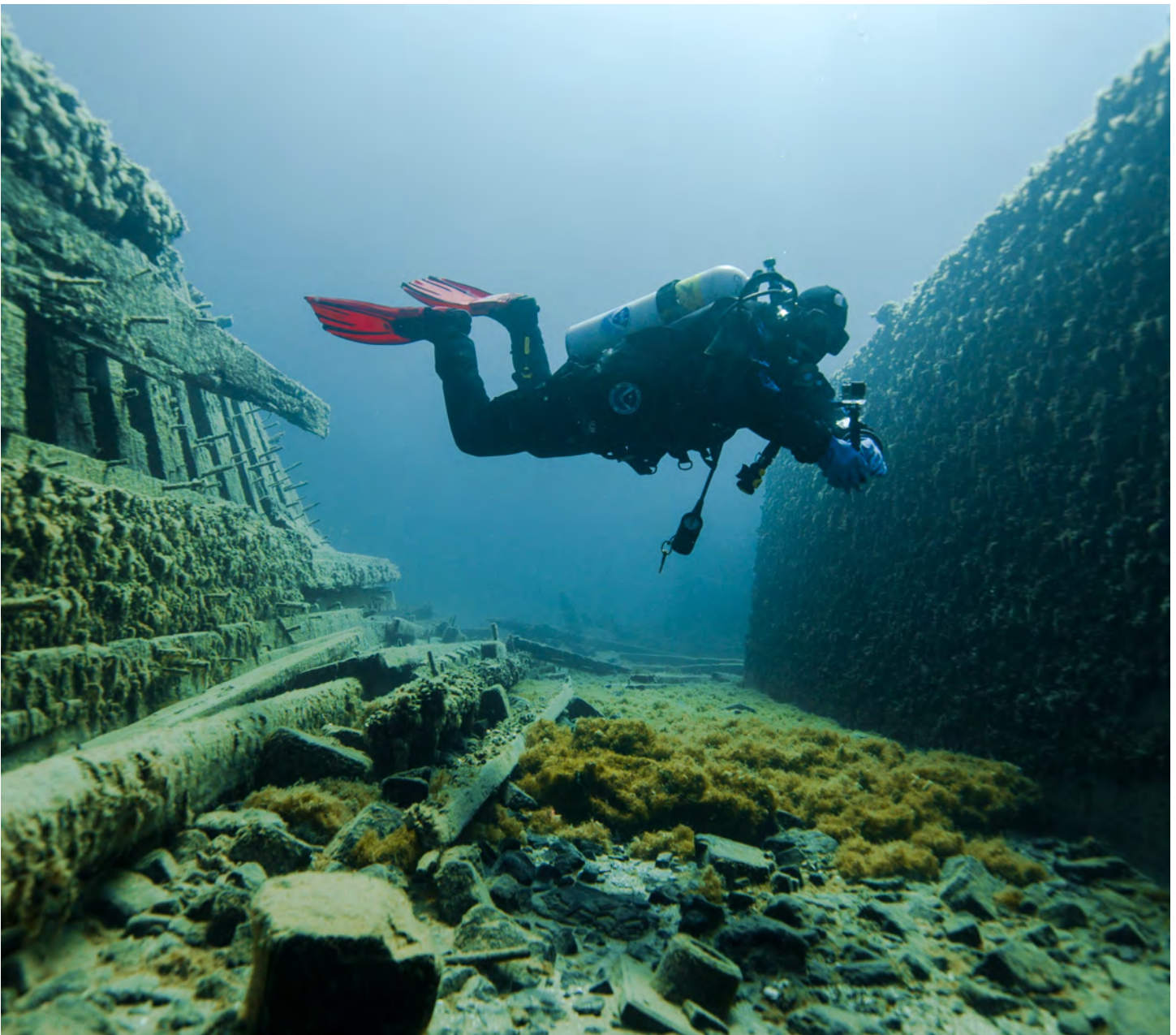
The cultural resources protected by the sanctuary are an irreplaceable connection to our collective past.

Communicating about climate change is important to build understanding of threats and changing conditions in the sanctuary and Great Lakes region. NOAA actively participates in outreach and education with students, teachers, and the public throughout the region to enhance understanding of the causes and impacts of climate change. One program, called “visualizing climate change,” allows docents to use NOAA’s innovative Science on a Sphere to communicate the global and local impacts of climate change in a way that is engaging, informative, and fun. In addition to the ways the sanctuary is addressing the impacts of climate change, there are many ways you can help .