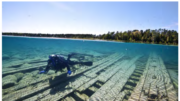
The Portland is just one of the shallow wrecks in Thunder Bay that could be affected by changing lake levels.

Annual evaporation is expected to increase in the region while the supply of water to Lake Huron is projected to become more variable. 4 Wetter springs and a decrease in summer rainfall by up to 15% are expected by 2100. 4,5 Further, periods of extreme rain 1,6 and extreme drought 4 are expected to become more