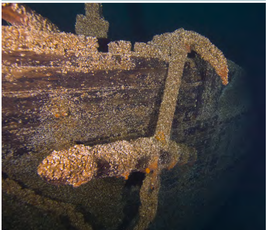
Many of the shipwrecks in Thunder Bay have already been colonized by zebra and quagga mussels. Ship IDs (top to bottom): Lucinda Van Valkenburg, Grecian, Kyle Spangler.