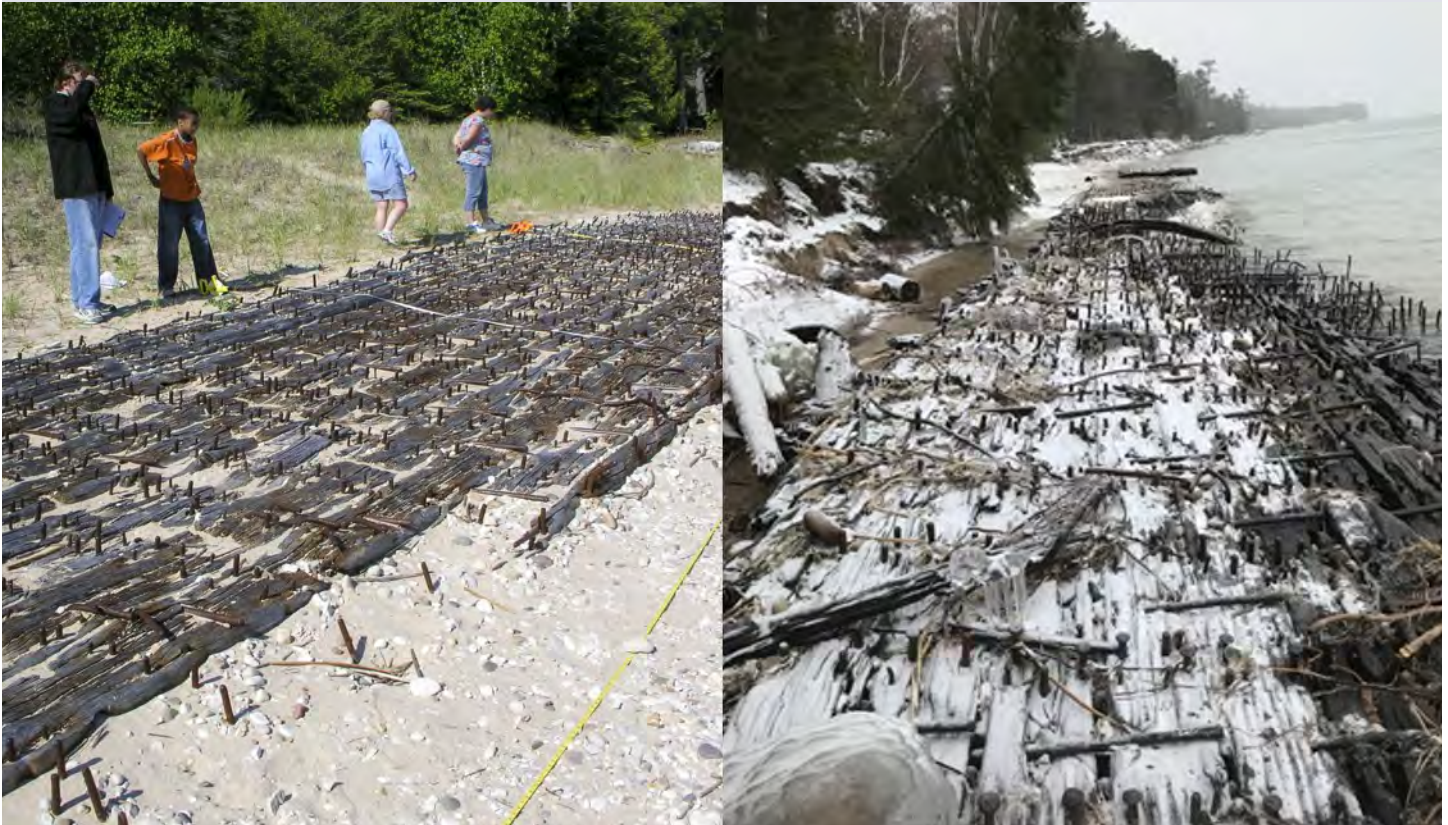
The beached starboard hull of the Joseph S. Fay could be impacted by increasingly fluctuating lake levels.

Chemical degradation of the Fay could also be accelerated by lake acidification , an increase in the acidity of water due to uptake of carbon dioxide. 9,18,19 Metallic portions of the wreck are the most likely to be impacted by acidification. 9,20 Copper, such as in the Fay's hull sheathing, is particularly sensitive to acidity. 9,20 Warming waters also increase the rate of chemical reactions, accelerating chemical and biological degradation. 6