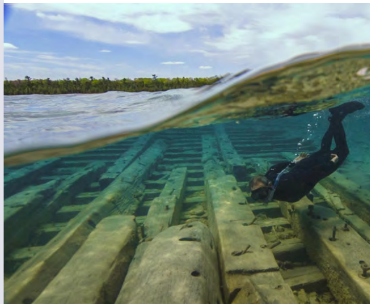
The Albany and other shallow wrecks could be impacted by changes to water levels in Lake Huron.

While the ultimate future trend in lake level is uncertain, projected increases in water level variability and extreme events pose a threat to the cultural heritage protected by the sanctuary.