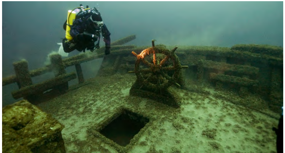
Metallic portions of cultural resources, such as the wreck of the F.T. Barney experience increased corrosion in increasingly acidic lake waters.

As carbon dioxide (CO 2 ) is released into the atmosphere, it is absorbed by lake and ocean waters, causing a chemical reaction that leads to waters becoming more acidic . Lake acidification differs from ocean acidification as the chemistry of most lakes, and the potential for acidification, is mostly driven by the chemistry of the water they receive from their watershed. However, much like the ocean, the Great Lakes are projected to experience increased acidification largely as a result of absorbed atmospheric CO 2 11 rather than from acid rain and other watershed inputs, although the effects could be cumulative.