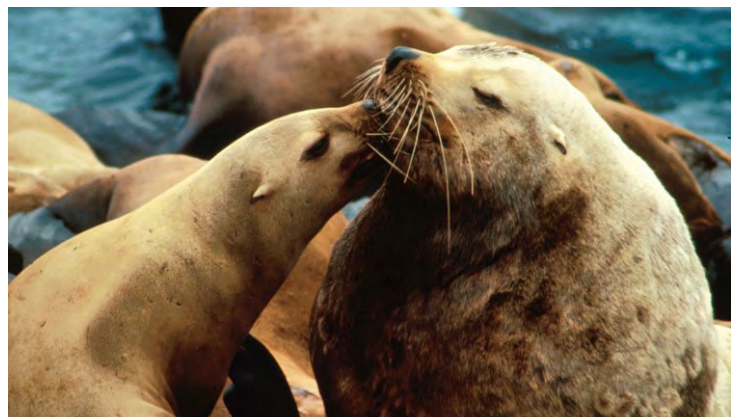
The habitats of many species in the sanctuary, such as Steller sea lions, could be degraded by sea level rise.

Sea level rise increases coastal erosion and will eventually drown beaches and rocky intertidal habitats in the sanctuary. This could inundate critical pupping and haul-out habitat for mammals such as northern elephant seals and Steller sea lions as well as nesting areas for birds like the American bittern and the threatened western snowy plover . 5,6 In fact, 1.6 ft of sea level rise would permanently flood 5% of the Farallon Islands, reducing areas vital for seabird nesting and mammal haul-out. 5 Intertidal species like mussels, oysters, and algae are also likely to be impacted by coastal stressors. Projected increases in