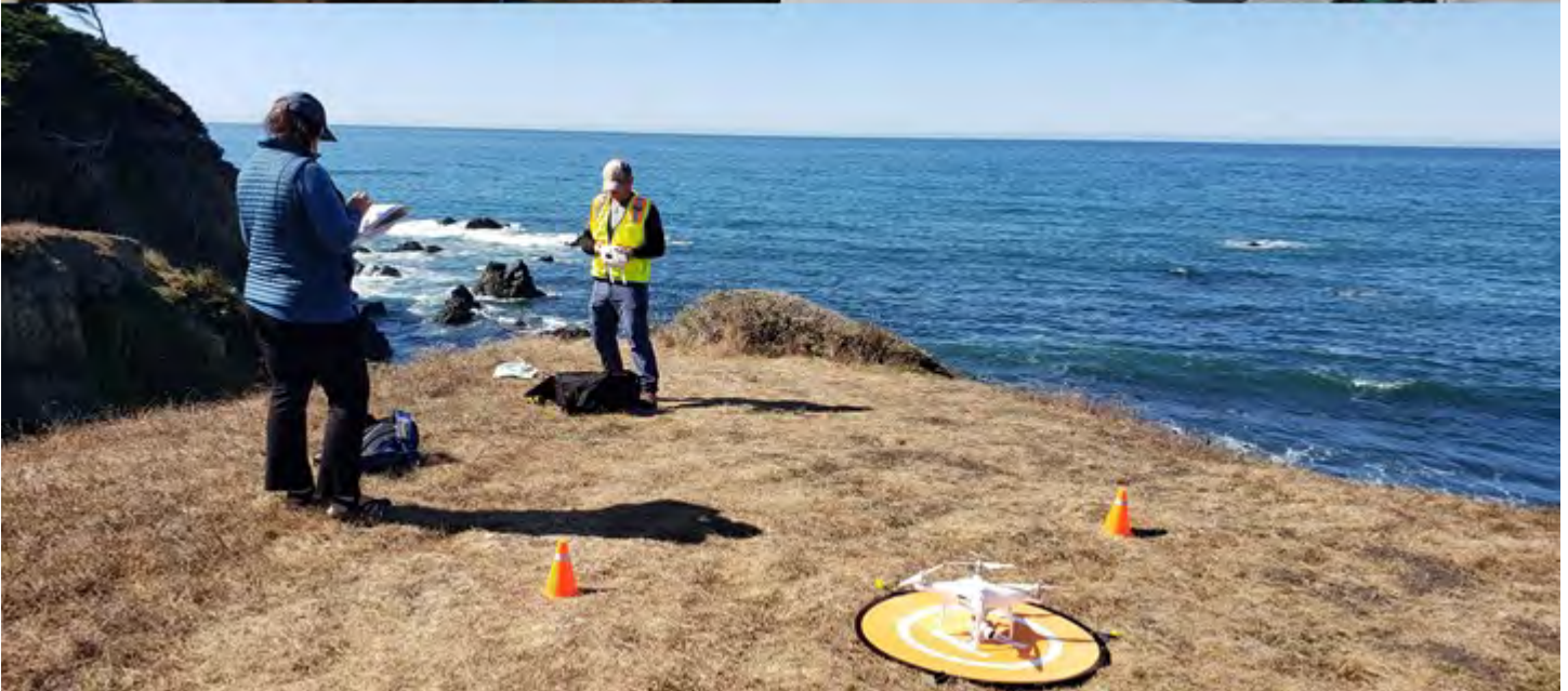
The staff and researchers of Greater Farallones work to understand the effects of climate change and share adaptation strategies.