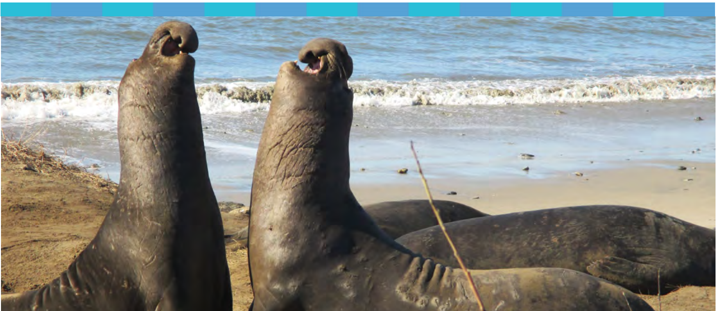
Greater Farallones National Marine Sanctuary is home to a great diversity of life from tiny zooplankton to huge northern elephant seals.