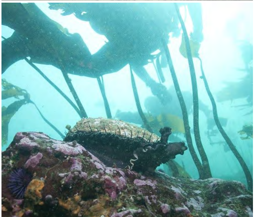
Many species in the sanctuary could be impacted by increasing water temperatures. Species IDs (top to bottom): Ochre sea stars, blackgill rockfish and pom pom anemone, black abalone.