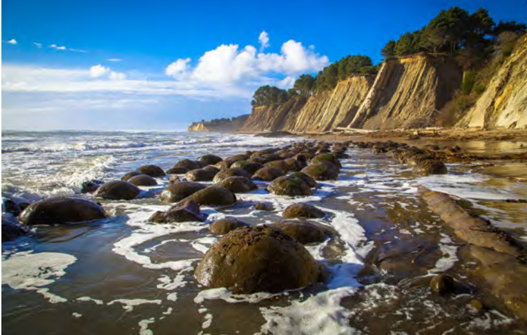
Beaches in the sanctuary may be at risk from increased erosion as a result of stronger storms.

Climate change is also altering precipitation. Snowpack in the Sierras has declined in recent decades 57,58 and areas historically dominated by