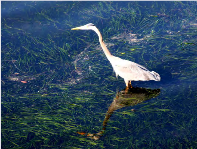
Eelgrass beds are vibrant ecosystems that also act as important blue carbon habitats within the sanctuary.

Within the sanctuary, plants such as eelgrass and salt marsh grasses collect carbon in their leaves, stems, and roots. When these plants die, some of this material is buried in the soil, where it can stay for hundreds or thousands of years. 12,19,20 In this way, these “ blue carbon ” ecosystems pull carbon out of the atmosphere. Globally, blue carbon ecosystems could sequester 866 million tons of carbon per year, 20 more than double the annual emissions of California. 21 While plants have mostly been identified as sources of blue carbon, there is growing recognition that soil and ocean animals also contribute to carbon storage and sequestration. 22-24