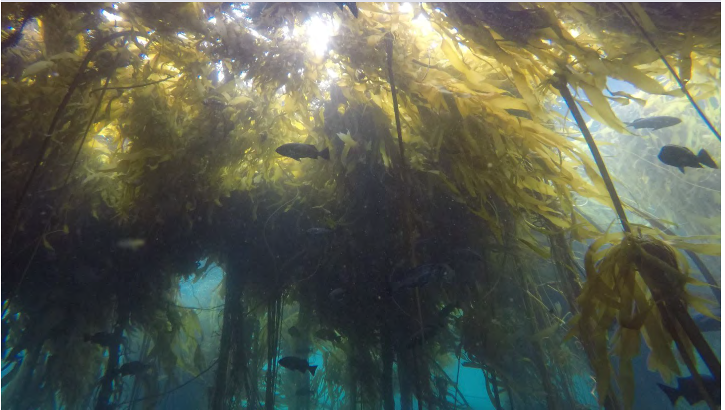
The kelp forests in the sanctuary are important blue carbon habitats and vibrant ecosystems.

While plants and algae may help mitigate climate change, blue carbon ecosystems are not immune to its impacts. Further, their disturbance or destruction could release stored carbon. 28,29 Sea level rise may drown tidal marshes and eelgrass beds 16,30 and warming waters threaten kelp reproduction. 31 Anomalously warm waters from 2014-2016 caused a cascade of events resulting in the loss of 90% of the region’s kelp canopy cover. 32 Such climate impacts could alter the ability of blue carbon ecosystems to store carbon in the future.