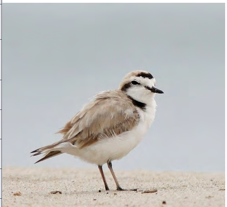
Threatened western snowy plover depends on beaches that could be degraded or destroyed by climate-driven changes.

Rising sea level also has the potential to threaten tidal marshes within the sanctuary. Salt marshes, like those in Tomales Bay , are important habitat for many species and provide ecological services like coastal protection and carbon sequestration. 9-12 These vibrant ecosystems sit at the interface of the land and ocean and depend on a steady supply of sediment from land to keep up with rising sea levels. Altered precipitation patterns, such as changes in snowpack, 13 more intense storms, and increases in the frequency and intensity of both extreme wet and extreme dry events, 14,15 could alter the amount and timing of sediment delivered to tidal marshes in the sanctuary. Partly due to these projected changes in sediment supply, tidal marshes may be unable to keep up with the expected rate of sea level rise. 16,17 In fact, tidal marshes in Bolinás Lagoon and elsewhere in the sanctuary could be completely lost by 2110 under extreme sea level rise projections. 16 Yet, if marshes are allowed to migrate up shore, as proposed in the sanctuary’s 2016 climate adaptation plan , 18 a large portion of these important ecosystems could be saved, even under extreme sea level rise. 16