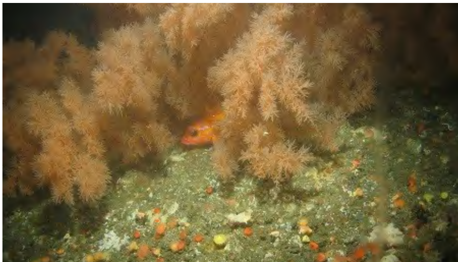
Deep sea corals provide habitat for many species in the sanctuary but may be threatened by the impacts of ocean acidification.

Since the beginning of the industrial revolution, ocean waters globally have become 30% more acidic . 64,65 Acidification in the sanctuary is being further accelerated by upwelling . Cool, nutrient-rich upwelled water fuels the sanctuary's ecosystem but is also more acidic than surface waters. Upwelling intensity has increased in recent decades, and is projected to continue to increase in the coming century. 34,35 As a result, California waters have increased in acidity by up to 60% since 1895 and could increase 40% above 1995 levels by 2050. 66,67