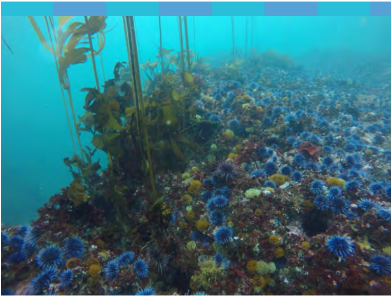
Conversion from kelp forest to urchin barren is one of the ecological changes that has occurred in some parts of the sanctuary.