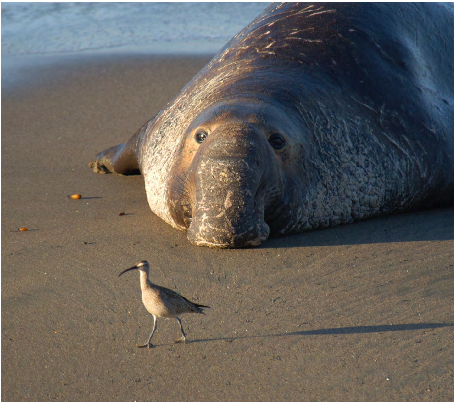
Northern elephant seals are just one of the many iconic species protected by the sanctuary.

Sanctuary staff and managers also actively participate in outreach and education with local and regional communities. NOAA incorporates climate change into its training of volunteers and its outreach and education materials and presentations. Through these efforts, NOAA is increasing public understanding and awareness of the impacts of climate change.