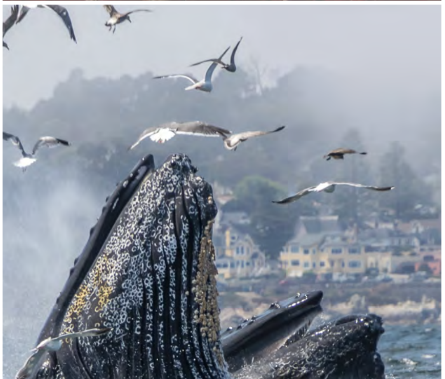
The sanctuary protects a great diversity of life, much of which is impacted by climate change. Species IDs (top to bottom): Pinot abalone, opalescent nudibranch, feeding humpback whales.