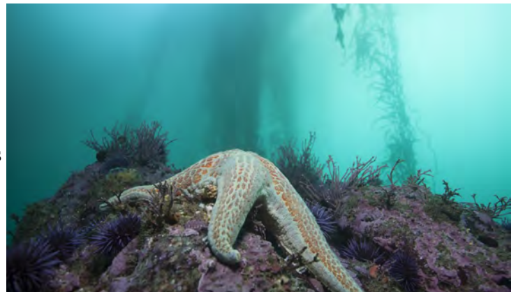
Sea stars are just one of the many organisms that could be impacted by rising water temperatures.

Rising temperatures and marine heatwaves can cause mortality events of intertidal organisms, such as mussels and oysters, and may increase the incidence of sea star wasting disease. 5,6 Further, warmer waters hold less oxygen and may cause oxygen concentrations to fall below the range of natural variability by 2030, 7 reducing habitat for rockfishes 8 and negatively affecting deep water corals . 9 Warming waters may also reduce the survival and reproduction of kelp 10,11 and create conditions that are too warm for some deep water corals. 12 Warming may force species in the