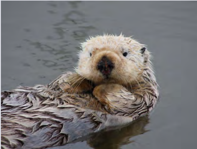
Sea otters are one of the many species in the sanctuary that depend on kelp forests.

The vibrant kelp forests of the sanctuary are home to hundreds of ecologically, economically, and culturally important species including rockfishes, abalone, and sea otters. Kelp forests also act as “ blue carbon ” habitats. As kelp grows, it stores carbon in its structures. As pieces of kelp break off, they can float up to 150 miles offshore 34 and sink to the deep ocean where their carbon can be buried for thousands or millions of years. 36 In the sanctuary, more than 100,000 tons of kelp can be transported through offshore canyons to the deep sea every year. 35,36 Globally, kelp and other macroalgae could sequester 200 million tons of carbon annually, 35 more than 35 times the annual emissions of San Francisco. 37