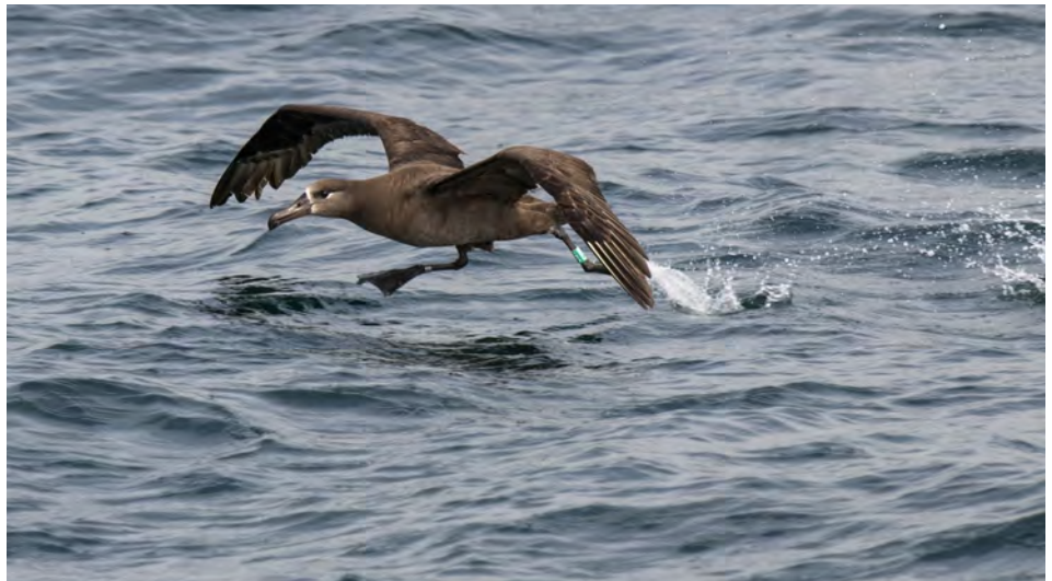
Black footed albatross and other predators, like whales and sea lions, could be affected by impacts to prey due to changing oceanographic processes.

Climate change is altering large-scale processes such as atmospheric circulation and El Niño . During El Niño events, the sanctuary experiences large waves, increased rainfall, reduced upwelling , and warmer water. 61,62 These effects could intensify in the future as the frequency and intensity of El Niño events are expected to increase. 38 The winds that drive upwelling are also expected to become stronger, increasing the frequency and intensity of upwelling, which could escalate ocean acidification. 32,33