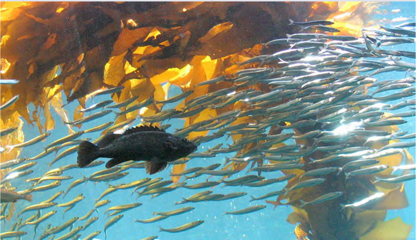
The vibrant kelp forests of the sanctuary provide habitat for hundreds of species.

While kelp may help mitigate climate change through carbon burial, it is not immune to its impacts. Warming waters can reduce kelp survival and reproduction 10,11 and kelp can be damaged by the strong waves associated with El Niño events, 7 which are projected to increase in frequency and intensity. 38 Kelp can also be impacted by ecological changes triggered by climate change. 39 In fact, anomalously warm waters from 2012-2016 appear to have contributed to a cascade of ecological events leading to the loss of 90% of the kelp canopy cover in some northern areas of the sanctuary. 39,40 This loss impacted species like rockfishes and sea otters and led to the closure of the valuable recreational red abalone fishery in 2018. 14 While climate change likely played a role in the kelp die off, 10,11 the immediate cause was a boom in purple sea urchin population. Ecological cascades, such as the sea urchin population boom and its impacts on kelp and other species, and other ecological changes, like shifting species, are likely to continue as the climate continues to change. These changes, together with other climate change impacts, could continue to alter kelp forest ecosystem functions and services.