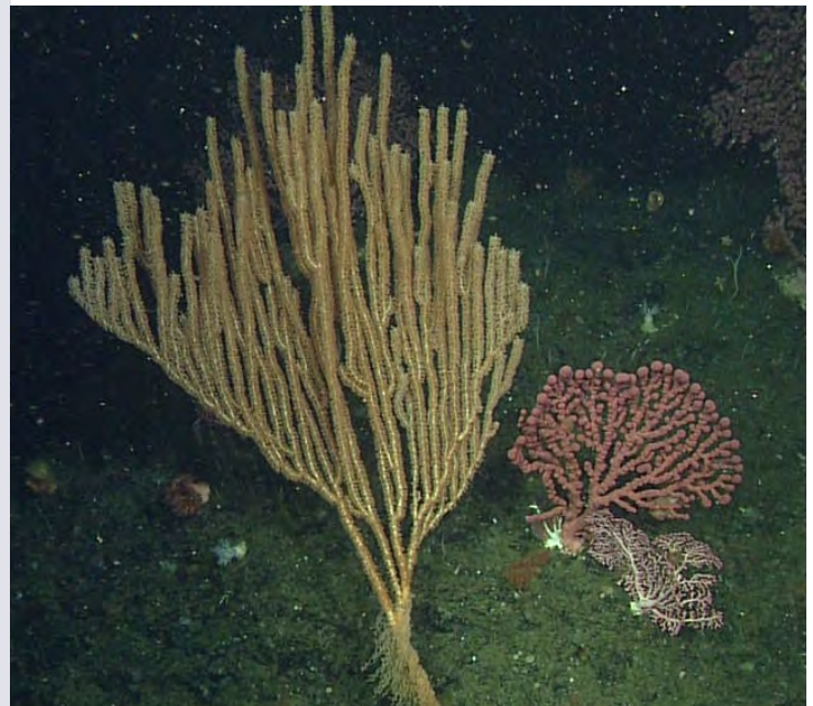
Increasing water temperatures could create conditions that are too warm for some deep water coral communities.

Globally, increasing temperatures are the primary cause of sea level rise through melting glaciers and thermal expansion of seawater. 1 Rising waters could threaten coastal habitats in the sanctuary including the salt marshes of Elkhorn Slough, 24 which are important for coastal protection and carbon sequestration , and beaches that are critical nesting and haul-out habitat for mammals like northern elephant seals and sea birds like the threatened western snowy plover . 25